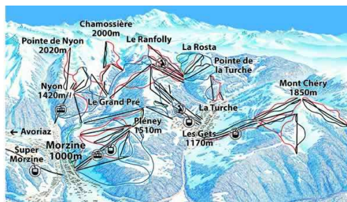
Plan of the Nyon / Pleney / Les Gets Lifts

Alternatively, the regular ski bus leaves from just outside the apartment, taking you directly to the centre of Morzine lifts and bus connections. At the end of the day, the slopes will bring you back to within a few yards of the apartment. Snow making equipment has been installed on the return piste, which should guarantee access in early and late season.