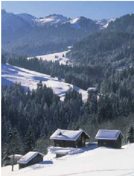
Mountains close to Morzine

Bedroom 1 has a double bed and a wardrobe unit surrounding the head of the bed providing ample storage. It also has an E facing window to catch the morning sun.