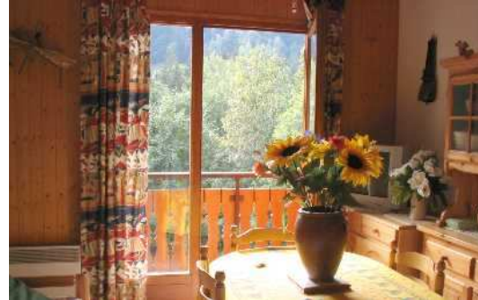
Living room with access to balcony

Our Chamossiere apartment is located close to the lifts and the slopes and sleeps up to 4 guests in 2 bedrooms.