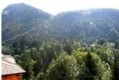
View from balcony along Nyon Cablecar

The apartment is accessible by car without snow chains in most conditions, although we recommend that you bring snow chains with you - just in case. The access roads and areas around the apartment are regularly cleared of snow as is the access route to our garage. The apartment also has a downstairs ski locker.